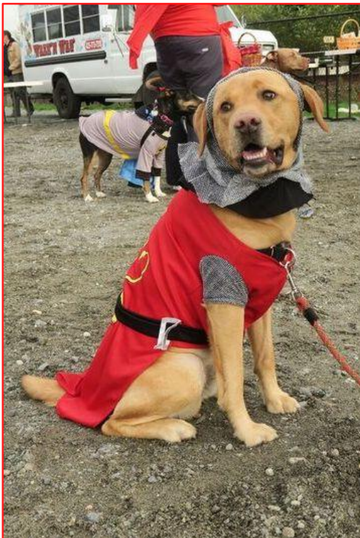
Game of Thrones Knight

Last year we had so many great costumes, there was Jimi Hendrix, Pico of Pokémon, Pirate, Hotdog, Peanut butter and Jelly and so many more.